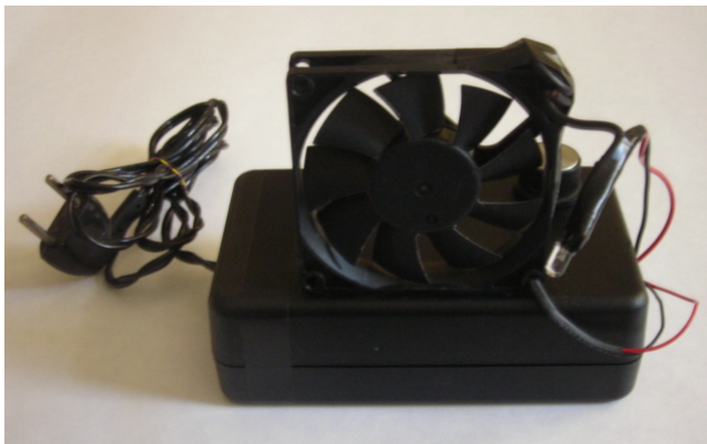
Fig. 2. Finished project.